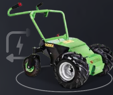
Donky: tool holder